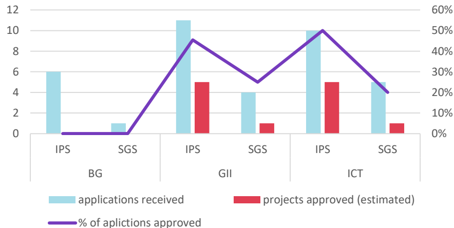
2nd Call - Overview of Applications